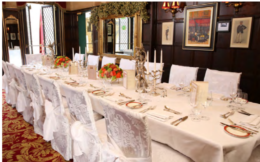
Set up for wedding breakfast